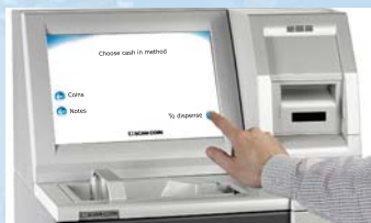
Touch screen for flexible and user friendly interface.