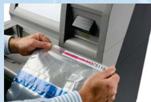
A barcode scanner is used to identify and register bags, envelopes, coupons, et c.