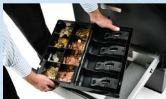
Coins are automatically dispensed into the cashier's specified cash drawer.

After registering on the RCS 800, the cashier selects the cash mix for the day. In less than 30 seconds, coins are automatically dispensed into the cashier's specified cash drawer, and a receipt is printed. Banknote solutions are available. Notes can be dispensed from a sidecar in parallel with the coins. All activities are registered in the machine's database or sent via the monitoring software to a central server.